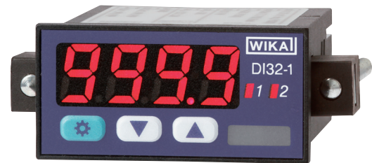
Digital indicator model DI32-1

It features a multi-function input with 23 different input configurations. The appropriate input signal can be selected through the terminal assignment and entering the corresponding parameters into the instrument configuration. Thus, the instrument can be used for the display of measured values from transmitters with current and voltage signals as well as those from resistance thermometers and thermocouples. Furthermore, it is possible to use the indicator for the measurement of frequency and rotational speed and also as an up or down counter.