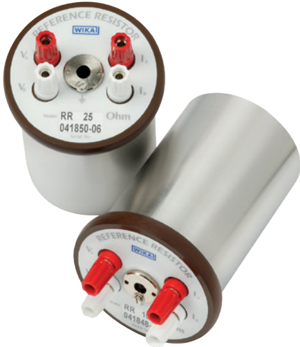
Model CER6000-RR reference resistor with different resistance range