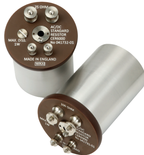
Standard reference resistor, model CER6000, 25 \Omega and 100 \Omega