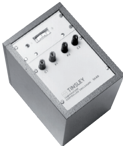
Thermal case for CER6000-RW resistors, at a fixed temperature of 36 °C [97 °F]