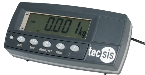
Strain gauge weighing electronics, model E1932